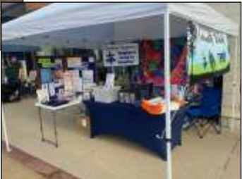
Right: Booth/Display at Otsego Creative Arts Festival in Otsego.