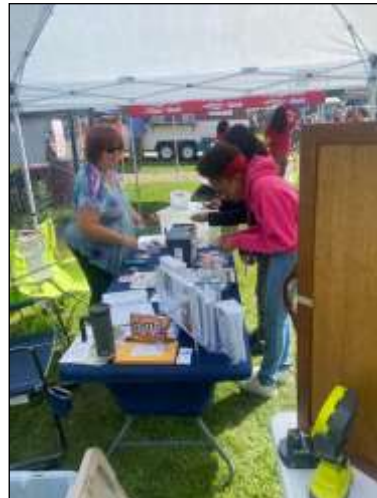
Right: Christian Neighbors attending the Scottish Festival in Kalamazoo.