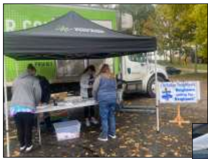
Left: Mobile Food Pantry at The Living Well in Kalamazoo.