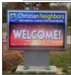
Our NEW Electronic Sign